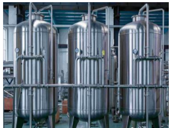
Pic.1 Water filter system

Used to remove calcium and magnesium ions from water, thereby softening the water.