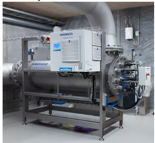
Pic.3 UV sterilizer

Pathogenic microorganisms can harm the human body only if they multiply in the body; when water is disinfected with ultraviolet light, this ability is lost and, as a result, any negative effect of microorganisms is excluded.