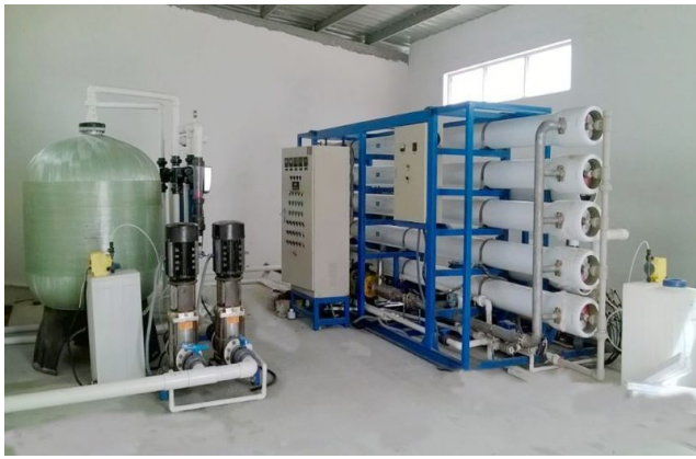
Pic.2 Reverse Osmosis Cleaning Equipment

Reverse osmosis technology is the most modern method that uses the principle of water molecules passing through a semi-permeable membrane under the influence of external pressure. With the help of the reverse osmosis process, it is possible to get rid of 98% of impurities dissolved in water (in industrial installations, the figure can reach 100%).