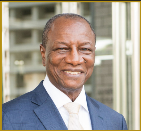
HEM the President of the Republic of Guinea, Professor Alpha Condé

The event is organized by the Private Investment Promotion Agency (APIP-Guinea) in collaboration with the African Development Bank (ADB) and the World Bank through its subsidiary the International Finance Corporation.